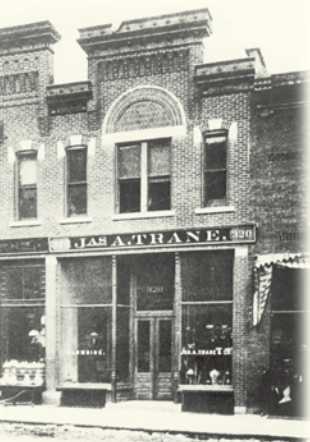
Trane Storefront La Crosse, Wisconsin 1891

Trane has a tradition of quality lasting more than a century.